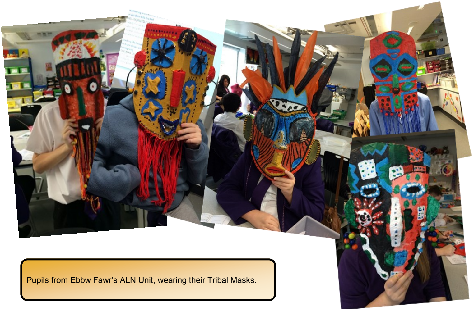
Pupils from Ebbw Fawr's ALN Unit, wearing their Tribal Masks.

Students from Pen-Y-Cwm special school visit Ebbw Fawr Secondary Phase to experience working with mainstream students and to benefit from the teaching and facilities on offer.